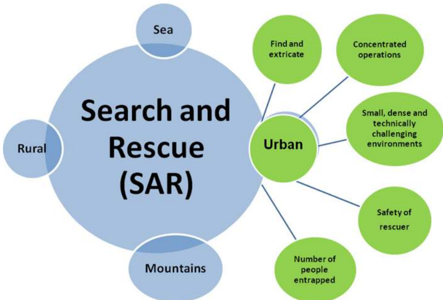
Fig. 1 The different environments of SAR operations and the main characteristics of USAR operations

Nevertheless, despite sustained, often heroic efforts, the relative number of rescued survivors from extended structural collapses remains small (Bartels and VanRooyen 2012). On the other hand, the number of structural collapses due to natural (e.g., Iran, 2003; Indonesia, 2004; Italy, 2009; Haiti, 2010; Japan, 2011), man-made disasters (e.g., Indonesia, 2002) or technological accidents (e.g., Holland, 2000; Russia, 2009; Canada, 2013) is increasing worldwide, raising the death toll of entrapped victims (EM-DAT The OFDA/CRED International Disaster Database 2014; EEA 2010; EERI 2011). To alleviate this,