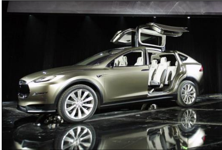
Exhibit 11 Tesla Model X