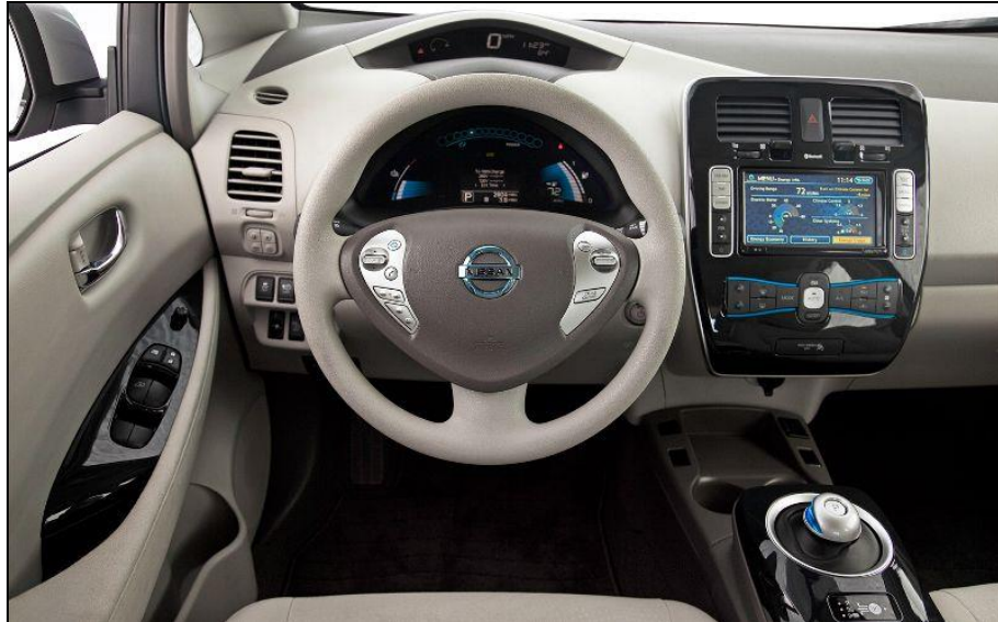
Exhibit 10 Dashboard of Nissan Leaf and of Tesla Model S