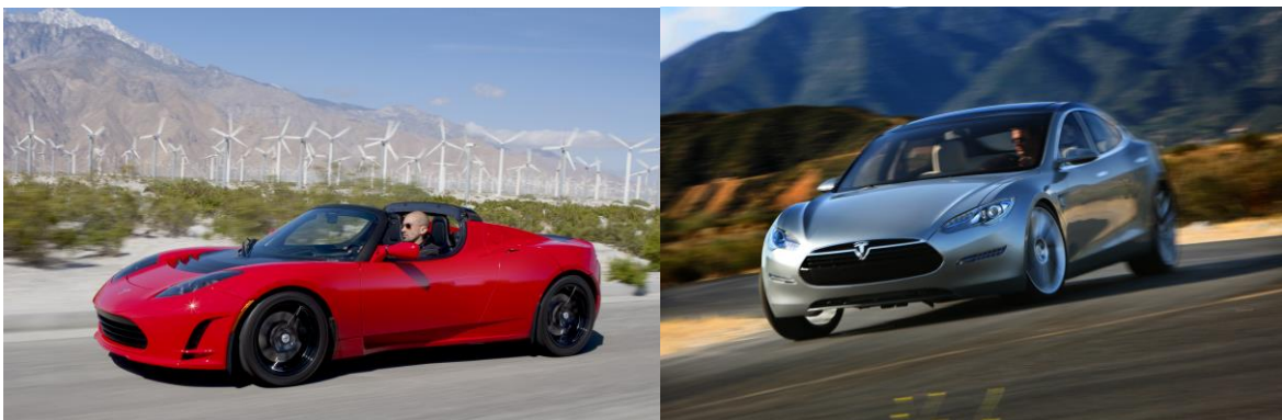
Exhibit 8 Tesla Roadster and Model S