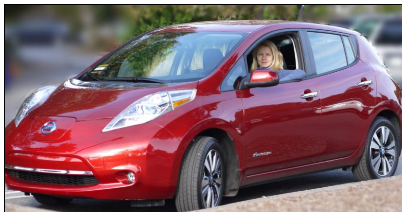
Exhibit 6 Nissan Leaf