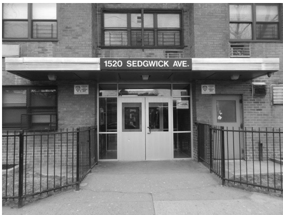
Fig. 1 1520 Sedgwick Avenue apartments in the Bronx

Avenue apartments (Fig. 1) in August, 1973 (Kosonovich 2014: 53–54). According to Tricia Rose (1994), hip hop culture, which encompassed fashion, break dancing, graffiti art, and rapping, “attempts to negotiate the experiences of marginalization, brutally truncated opportunity, and oppression within the cultural imperatives of African American and Caribbean history, identity, and community” (Rose 1994: 21). The origin of rap was born from fusing African, Caribbean, and African American traditions to express modern inner city experiences.