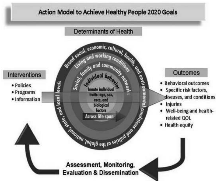
Fig.1. Scientific Advisory Committee Ecological Model Recommended as a Framework for Healthy People 2020.