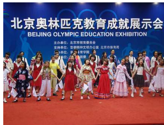
International song and dress at the Olympic Education Exhibition, May 2008.

important point: true, one major goal was patriotic education – but as in Tokyo, the old nationalist symbols were re-shaped by association with symbols of internationalism, the global community, and world peace. This is the paradox of the Olympic Games – they reinforce nationalism and internationalism at the same time. Perhaps the national identity itself is not greatly changed, but it is an important shift in orientation if the holders of that identity start to see their nation as an equal partner among friendly nations instead of a victimized nation among hostile nations.