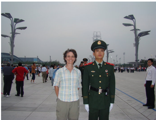
The author posing with a soldier guarding the VIP lane at the closing ceremony, following the example of Chinese spectators.

time that China also started sending riot police on U.N. peacekeeping missions. Clad in black, physically bigger (many are former wushu and judo athletes), and more highly trained and educated than the regular and armed police, they were brought out in large numbers to protect sensitive locations in Beijing. Their training drills were shown on CCTV in dramatic ways that promoted a positive image of them as anti-terrorist police ready to help evacuate a stadium in case of a bomb or to secure the release of innocent spectators taken hostage. The riot police are more frequently deployed to control the local populace than to deal with terrorists – indeed, on the night of the opening ceremony I watched them clear out the crowd that had gathered in the square at the central train station to watch the opening ceremony on the big-screen TV, when the security personnel decided the crowd was too big and the situation was dangerous. However, the effect of the Olympic coverage may have been similar to that described by Tagsold for the Japanese Self-Defense Forces – their image was improved by linking them with keeping the peace at the Olympics.