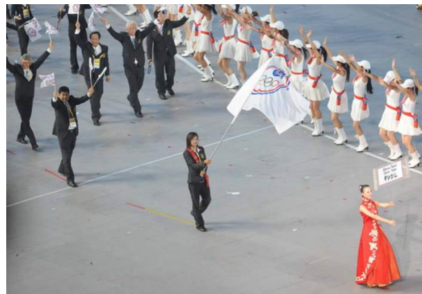
Chinese Taipei enters the stadium in the opening ceremony.

last, and so it was not a factor. As with the torch relay, Taiwan refuses to march adjacent to China in the Parade because it would symbolize it as a province of China; this is a problem in English, as well, which has been solved by having Taiwan march with the “T’s.” The problem was solved by inserting the Central African Republic between Taiwan and Hong Kong – since “China” literally means “central country,” the Central African Republic shares the character zhong with them. Ironically, the stroke order placed Japan before Chinese Taipei, but with Taiwan’s former colonial status no longer problematic for Taiwanese identity, this was not an issue.