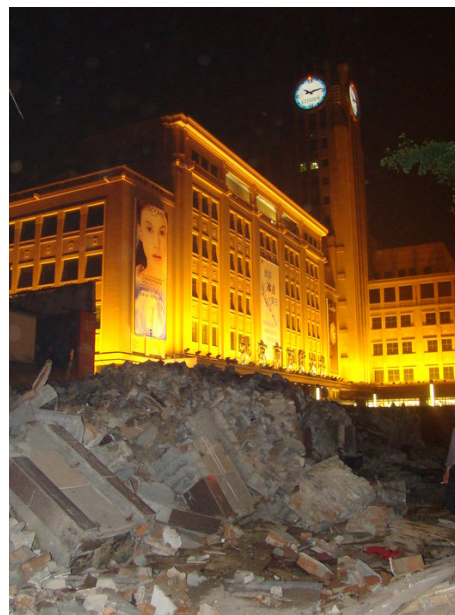
Demolition along Wangfujing Street, Beijing,

bid against Seoul for the 1988 Summer Olympics; Osaka's bid against Beijing for the 2008 Games (revealing a lack of solidarity in the East Asian bloc within the IOC); Sapporo's successful bid for the 1976 Winter Games; and Nagano's successful bid for the 1998 Winter Games. As discussed in Bill Kelly's accompanying essay, Tokyo is currently bidding for the 2016 Summer Olympics. Japan's repeated bids, and the massive urban development projects proposed in the Tokyo 2016 bid, seem to indicate that the momentum toward organizing Olympic Games in association with large-scale development is more powerful than the anti-Olympic and pro-environment movements. Japan has also violated customs of bloc voting within the IOC and sacrificed East Asian solidarity for its Olympic bids. Similarly, a forthcoming chapter by James Thomas based on his fieldwork among urban squatters in Seoul in 1988 concludes that the Seoul Olympics enticed Korean citizens to support the state's grandiose development program by linking it with a "new empowered nationalism;" he observes that even after ex-presidents Chun and Roh were imprisoned and discredited, the Olympics-inspired development program continued.[18]