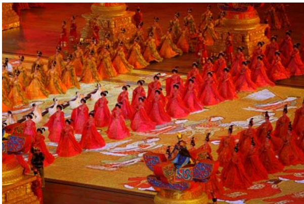
Tang Dynasty Symbolism in the Opening Ceremony. From BOCOG official website ( http://en.beijing2008.cn )

should be added into the long-term strategic plan for the national image afterwards"[5]. Although the vast majority of educational and cultural programs surrounding the Beijing Olympics targeted the domestic population (see the discussion of Olympic education below), a debate about the target audience for the opening and closing ceremonies was resolved in favor of the international audience. Film director Zhang Yimou, the choreographer of the ceremonies, is not well-regarded inside China, where his work is seen as pandering to Western tastes with a superficial and exoticized picture of traditional Chinese culture. His "Eight Minute Segment" in the closing ceremony of the Athens Olympics was so disliked that the bid competition for the choreography of the 2008 ceremonies was reopened. That Zhang was finally re-confirmed in 2005 indicates that the final decision was to prioritize international tastes over domestic.