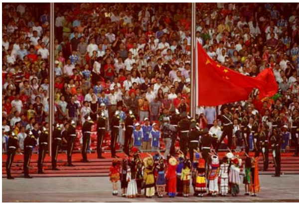
The raising of the Chinese flag in the opening ceremony.

being raised in the stadium and heard the wild cheering of the crowd, he had gotten tears in his eyes, and this had been the first time in his life that this had ever happened to him. From this perspective, he agreed with my conclusion. Our conversation took place during a dinner to which I had been invited so that I could advise him on whether to accept admission to the Master's Degree programs at the University of Pennsylvania or the University of Southern California, with an eye to which city would offer better future employment opportunities.