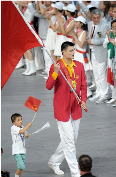
Yao Ming, flagbearer for China, enters the stadium with Lin Hao, earthquake survivor.

unintentionally flipped the flag, because no official explanation was issued, and Xinhua news agency requested clients not to use a photo of it shortly after sending it out. While not as forceful as the image of Japan victimized by the atom bombs, within China these symbols did preserve the Chinese narrative of victimization in the midst of the most grandiose Olympics ever.