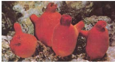
Halocynthia papillosa (Burton 1980)