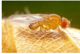
Drosophila melanogaster (Lawrence 1992)