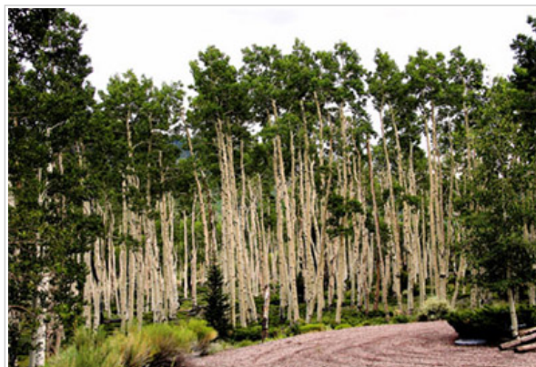
Figure 1: "Pando" is a giant aspen clone in the Fish Lake National Forest, Utah.

The 1.8 million species described by science are incredibly diverse. They range from tiny, single-celled microbes like Nanoarchaeum equitans , 400 nm in diameter living as parasites on other microbes in thermal vents at temperatures of 70–98°C (Huber et al. 2002), to giant organisms like Sequoias , blue whales, the "humungous fungus," and "Pando" (Figure 1). "Pando" is the name given to a clonal stand of aspen trees, all genetically identical and attached to each other by the roots (Grant et al. 1992). The stand covers 106 acres and weighs 13 million pounds. The "humungous fungus," a giant individual of the species Armillaria oysteræ is found in the state of Oregon, and covers 1,500 acres (USDA Forest Service 2003).