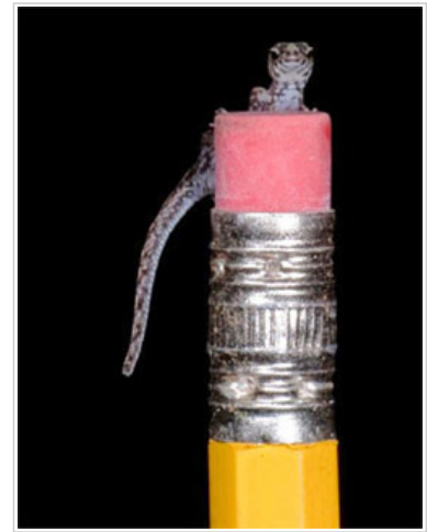
Figure 2: Over 15,000 new species are described each year.

Because people have ventured to all parts of the globe, one might expect that the new species being discovered each year would be microscopic organisms that can only be distinguished at the metabolic level. While it is true that most new species identified are insects, microbes and fungi, we are still discovering new vertebrates (Figure 2), even sizable new vertebrates such as a new species of baleen whale and a clouded leopard. Since 2000, 53 new species of primates have been described (IUCN 2008) including a new species of Brazilian monkey, Mura's saddleback tamarin.