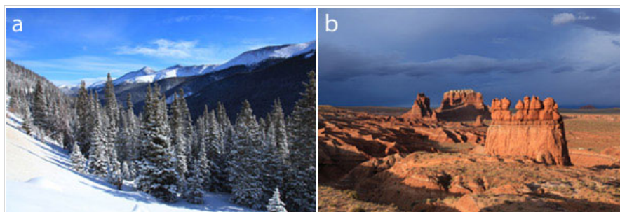
Figure 3: Physical features of an ecosystem affect what species survive there.

Ecosystems include all the species, plus all the abiotic factors characteristic of a region. For example, a desert ecosystem has soil, temperature, rainfall patterns, and solar radiation that affect not only what species occur there, but the morphology, behavior, and the interactions among those species (Figure 3). When ecosystems are intact, biological processes are preserved. These processes include nutrient and water cycling, harvesting light through photosynthesis, energy flow through the food web, and patterns of plant succession over time. A conservation focus on preserving ecosystems not only saves large numbers of species (including non-charismatic species that do not receive public support) but also preserves the support systems that maintain life