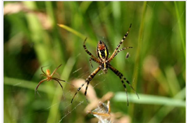
Figure 4: The tensile strength of spider silk provided inspiration for engineering a similar synthetic fabric.

In addition, living organisms provide inspiration for engineers seeking better and more efficient products. The field known as biomimicry is the study of natural products that provide solutions to human needs. For example, shark skin provided the model for hydrodynamic swimming suits. The glue used by Sandcastle worms ( Phragmatopoma californica ) to cement together their sand particle shells was the inspiration for a glue that mends fractured bones in the aqueous internal environment of the body. Finally, scientists are using the chemical nature of spider's silk to design strong, lightweight fibers (Figure 4).