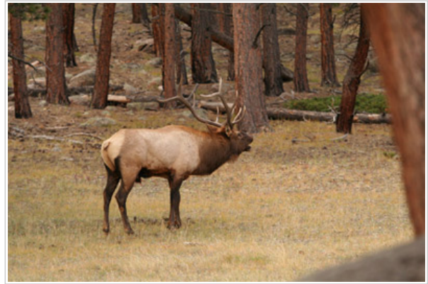
Figure 6: People flock from around the world to see the bull elk bugling and displaying during mating season at Rocky Mountain National Park.

While modern arguments often focus on the anthropocentric value of biodiversity, nature writers such as Emerson, Thoreau, Leopold, Muir and many others emphasized the intrinsic values of biodiversity. As Henry David Thoreau said, "This curious world which we inhabit is more wonderful than it is convenient; more beautiful than it is useful; it is more to be admired and enjoyed than it is to be used" (1837).