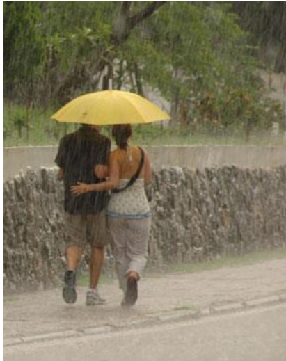
Break from the storm

Third party intervention is when a neutral outside party works with parties in a conflict to facilitate a resolution.