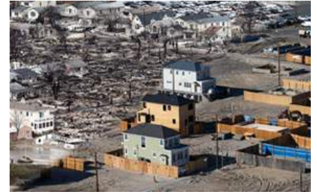
Hurricane Sandy, Before and After, One Year Later

THESE realities of inner-city life are largely absorbed on the streets. At an early age, often even before they start school, children from street oriented homes