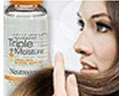
11 Best Shine Serums and Sprays Total Beauty