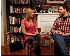
What Kids Who Don't Eat Vegetables Look Like When They Grow Up Nick Mom