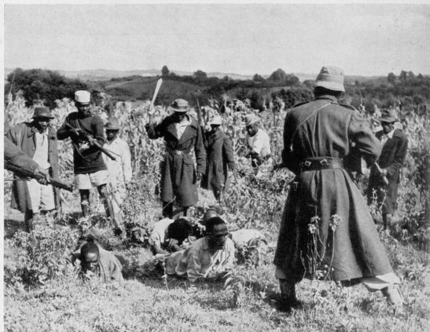
ROUNDING UP A NUMBER OF MAU MAU SUSPECTS WHO HAD BEEN HIDING IN A MAIZE PLANTATION IN THE MAHIGA LOCATION OF KENYA: It was believed that hardened Mau Mau criminals were hiding in this area, committing crimes both in the Reserve and on the other side of the Aberdares at Thomson's Falls. About 140 suspects were taken to Nyeri after the raid by two companies of the 5th King's African Rifles, assisted by police and the Kenya Regiment. Local "Home Guard" groups also helped the soldiers.

After the raid members of the Kikuyu "Home Guard" marched back to their homes in high spirits at their success, laughing and shouting as they went.