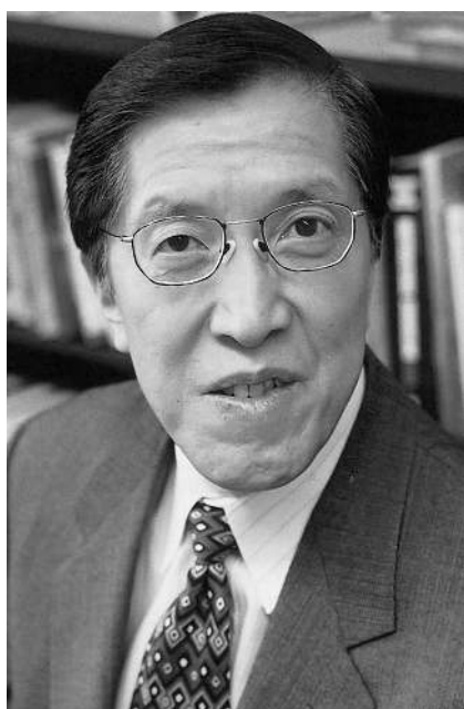
Derald Wing Sue

racial microaggressions has been proposed to explain their impact on the therapeutic process.