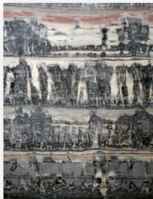
▲ Cap carbonate

Life’s earliest manifestations—primitive single-celled organisms that “fed” on the chemical energy of rocks—cannot have had much effect on Earth’s mineralogical diversity. To be sure, geologists have found biologically mediated rock formations dating back to 3.5 billion years ago, including reefs made of calcium carbonate and so-called banded iron formations (in which iron oxides apparently lock away the first oxygen produced by life). But the land was still barren, the atmosphere at large still lacked oxygen, surface weathering was slow, and the earliest life contributed almost nothing to alter the number of minerals present or their distribution.