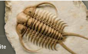
► Fossil trilobite

pounds. From space, Earth's continents two billion years ago might have looked something like Mars, albeit with blue oceans and white clouds providing dramatically colorful contrasts.