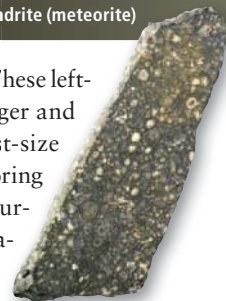
▶ Chondrite (meteorite)