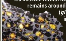
◀ Olivine crystals in pallasite (meteorite)

4.6 BILLION YEARS AGO: Millions of planetesimals form in the disk of dust and gas that remains around the recently ignited sun (in background) and collide to form Earth (glowing planet). More than 200 minerals, including olivine and zircon, develop in the planetesimals, thanks to melting of their material, shocks from collisions, and reactions with water. Many of these minerals are found in ancient chondritic meteorites.