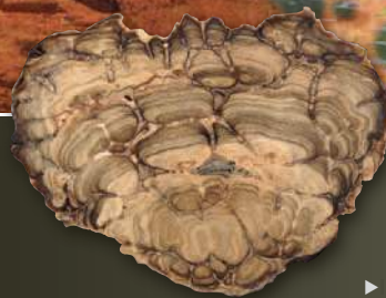
◀ Fossil stromatolite cross section

2 BILLION YEARS AGO: Photosynthetic living organisms have given Earth's atmosphere a small percentage of oxygen, dramatically altering its chemical action. Ferrous ( \text{Fe}^{2+} ) iron minerals common in black basalt are oxidized to rust-red ferric ( \text{Fe}^{3+} ) compounds. This "Great Oxidation Event" paves the way for more than 2,500 new minerals, including rhodonite (found in manganese mines) and turquoise. Microorganisms ( green ) lay down sheets of material called stromatolites, made of minerals such as calcium carbonate.