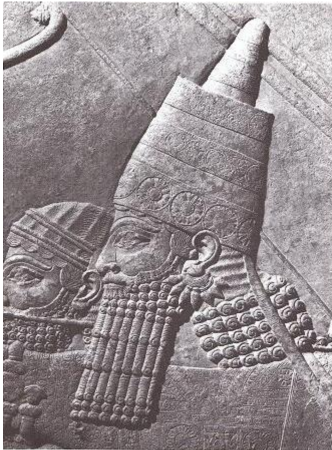
King Ashurbanipal, 669-627 B.C.. The excavations of his library provided a major source of Mesopotamian literature, including a good portion of the Epic of Gilgamesh.

So the trapper set out on his journey to Uruk and addressed himself to Gilgamesh saying, 'A man unlike any other is roaming now in the pastures; he is as strong as a star from heaven and I am afraid to approach him. He helps the wild