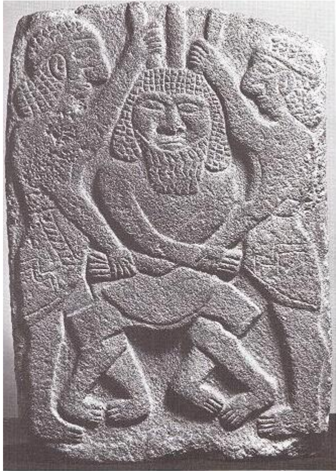
Gilgamesh and Enkidu's battle with Humbaba.

Gilgamesh replied: 'Where is the man who can clamber to heaven? Only the gods live for ever with glorious Shamash, but as for us men, our days are numbered, our occupations are a breath of wind. How is this, already you are afraid! I will go first although I am your lord, and you may safely call out, "Forward, there is nothing to fear!" Then if I fall I leave behind me a name that endures; men - will say of me, "Gilgamesh has fallen in fight with ferocious Humbaba." Long after the child has been bony in my house, they will say it, and remember.' Enkidu spoke again to Gilgamesh, 'O my lord, if you will enter that country, go first to the hero Shamash, tell the Sun God, for the land is his. The country where the cedar is cut belongs to Shamash.'