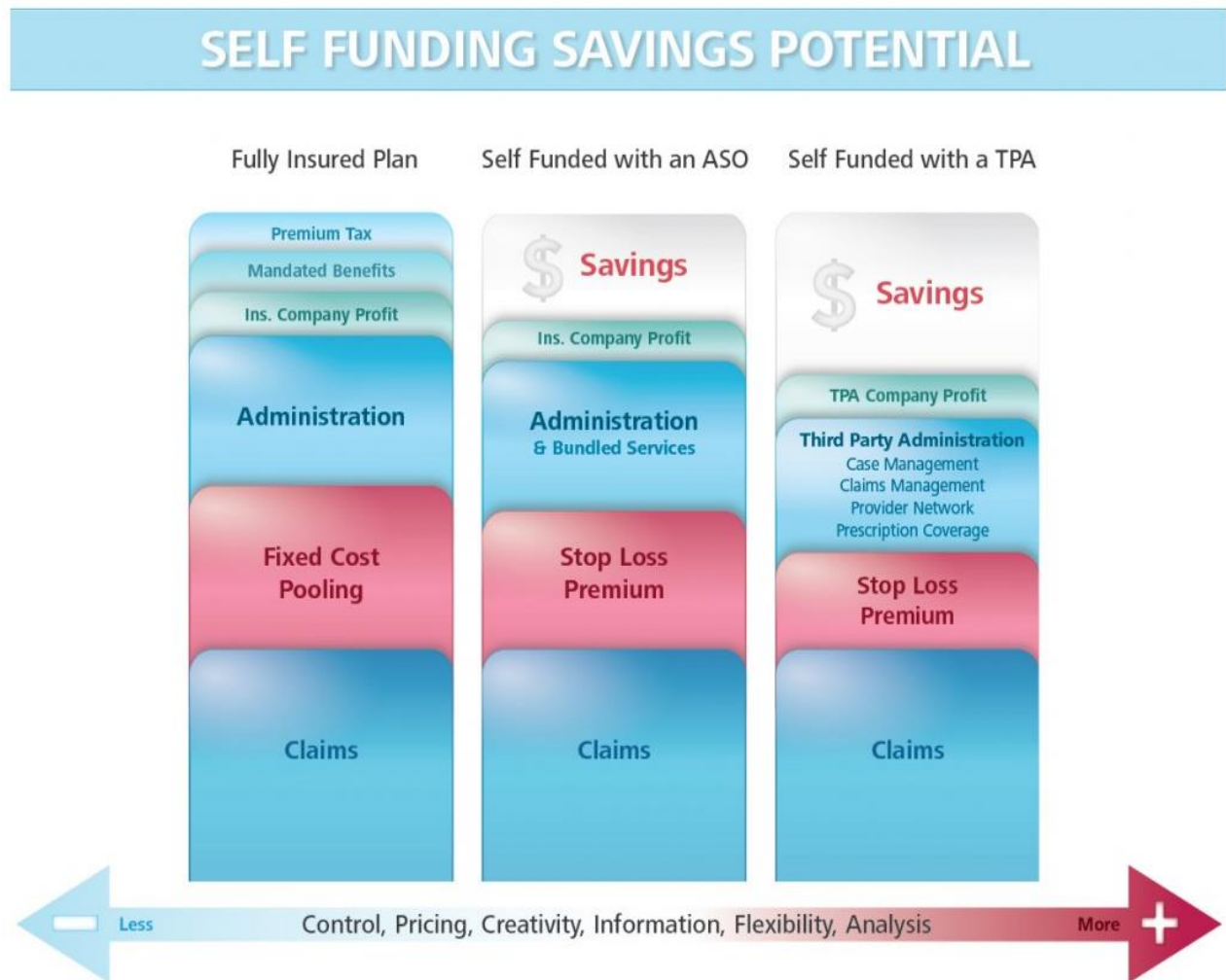
Exhibit 3 – Potential savings with a TPA