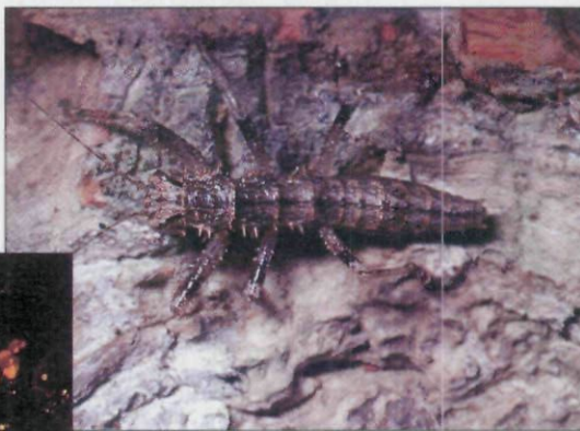
Imposing order. A recently discovered specimen from Africa (above) and an amber-encased fossil from Europe (left) indicate the new order's wide distribution.